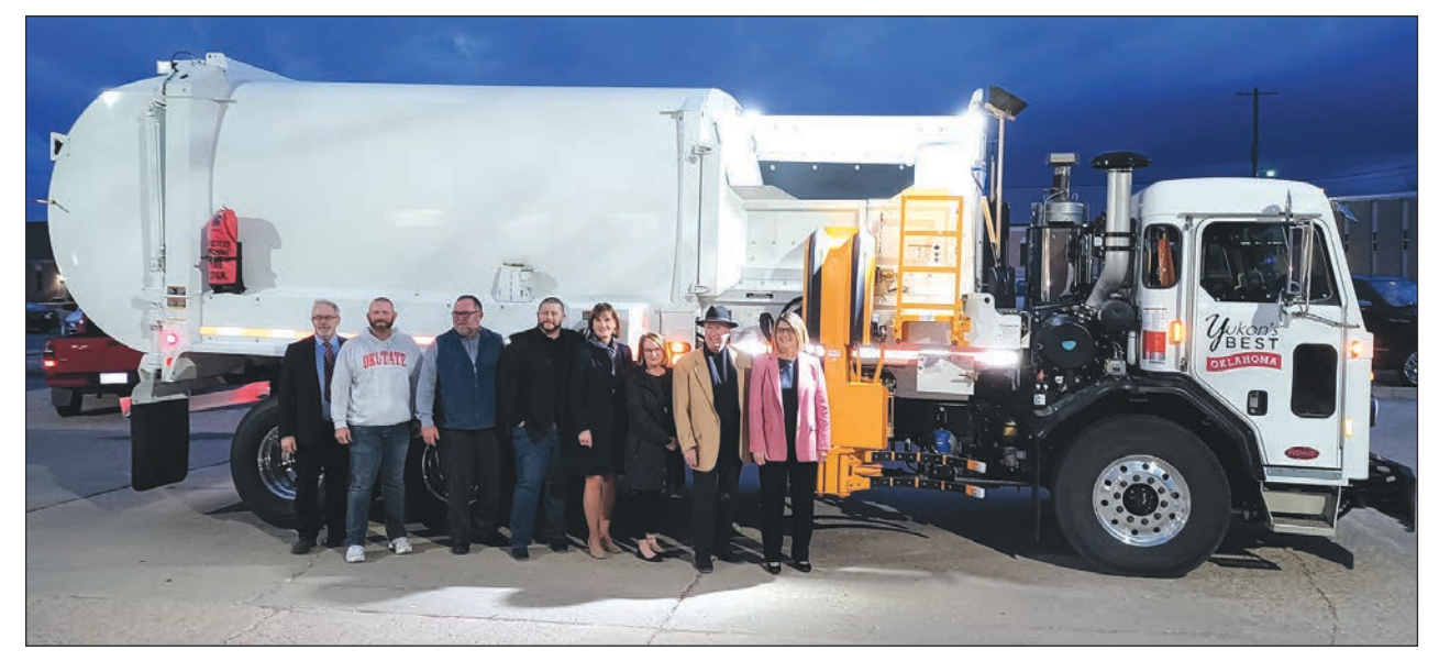
Yukon City Council members and city administrators welcome delivery of the City of Yukon's new trash truck before Tuesday night's council meeting at the Centennial Building, 12 S 5th.