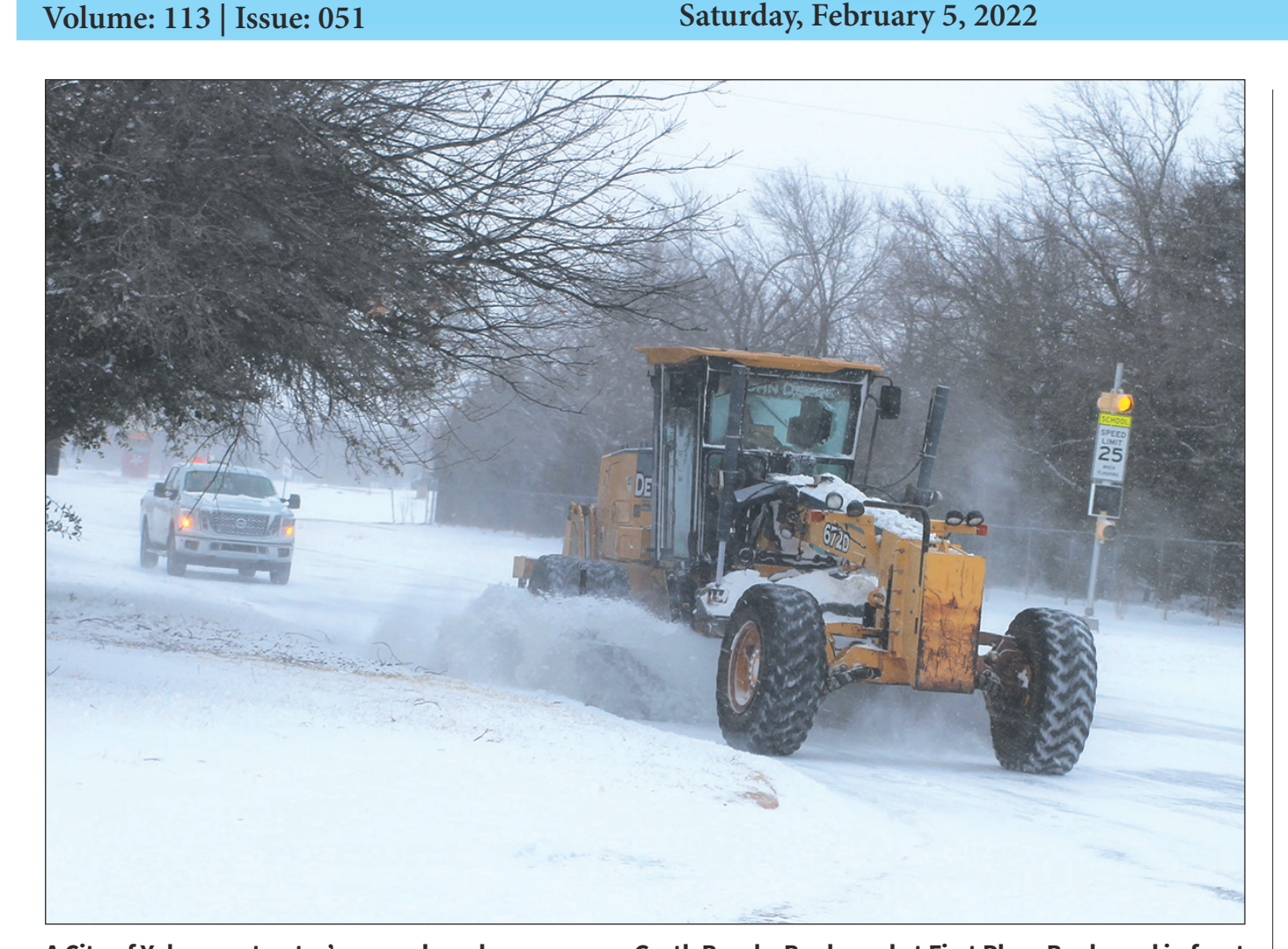
A City of Yukon contractor's snowplow clears snow on Garth Brooks Boulevard at First Place Boulevard in front of the Yukon Post Office.