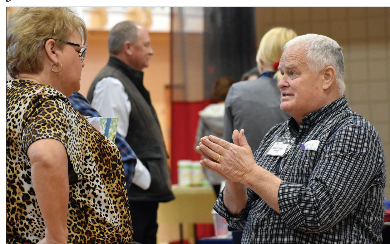
Mustang Parks and Recreation on Tuesday held its annual wellness fair in the Town Center recreation center. The event

The fair – which historically was held in the entry halls of Town Center – was moved to the recreation center last year due to health and safety concerns surrounding the novel coronavirus pandemic. those