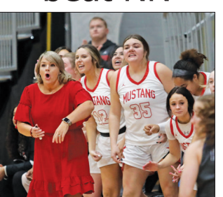
Mustang High School's girls basketball team beat Norman North last week. -See Page 1B