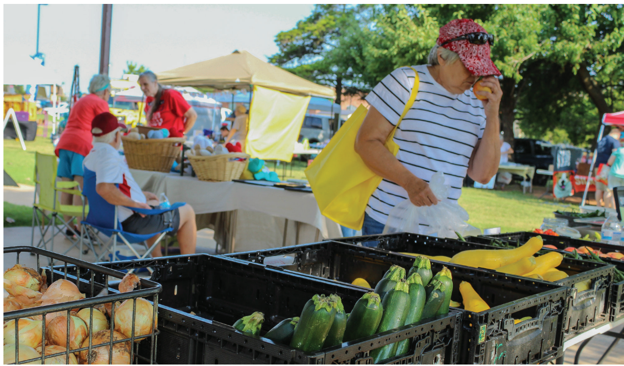
A resident takes a whiff of a veggie at Wildhorse's Farmers Market Aug. 7. Wildhorse Gardens and Market sells fresh vegetables, homemade goods and more from 6 to 8 p.m. Wednesdays and from 8 a.m. to noon Saturdays. The organization accepts Supplemental Nutrition Assistance Program benefits. Market days are ongoing until September.