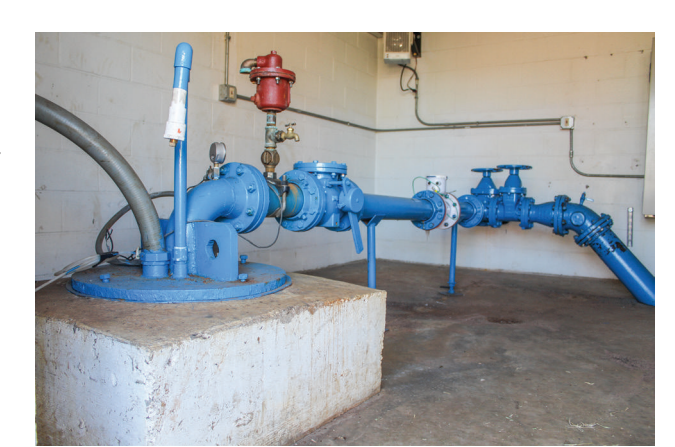
Mustang well 12 is located at SW 119th Street and Pennslyvania Avenue. Wells 12 and 2 will receive the new water filtering system in 2021.

Power also extends to the machines in the